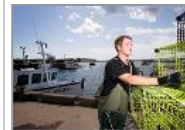
Lobster Season Closes