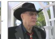
Sydney Voters Voice Opinions on Election Day