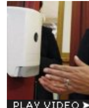
PLAY VIDEO ▶ Flu plan in Sask. native community could be national model