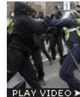
PLAY VIDEO ▶ Protest breaks out at Olympics